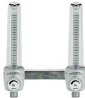
Dual Flowmeter with T Connector and ISO color coding Inlet: 1/8" NPT(F)