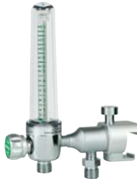
Flowmeter with Rail Clamp (10*25mm) Inlet: DISS