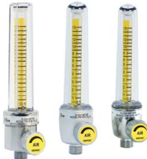
FM181-15L-XX Square Tube Chrome-plated Brass Body