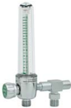
Flowmeter with Power Take Off Connector Inlet: 1/8" NPT(F) , Outlet: DISS