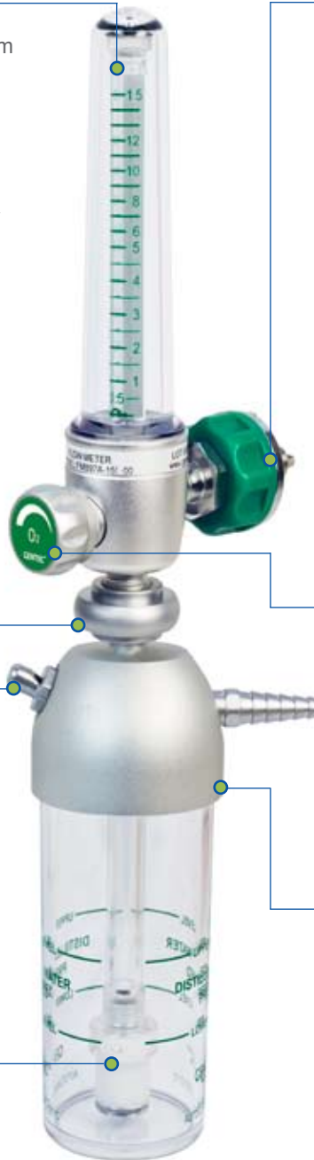
FM897A-15L2-OH Flowmeter with Humidifier Oxygen(0-15L) OH inlet adapter