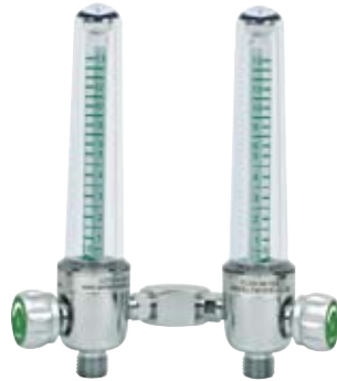
Dual Flowmeter with Y Connector Inlet: 1/8" NPT(F)