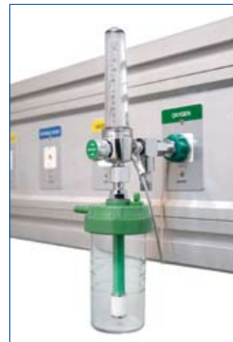
Flowmeter Humidifier with FM-PTO Power Take Off, Ohmeda Adapter, and Retaining Wire.