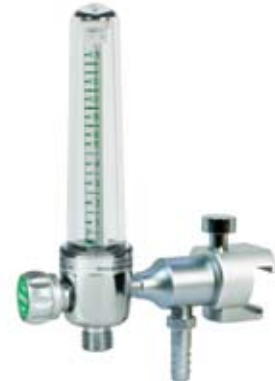
Flowmeter with Rail Clamp (10*25mm) Inlet: 1/4" , 5/16" Hose Barb