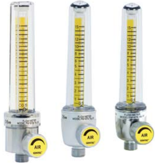
FM181-15L-XX Square Tube Chrome-plated Brass Body