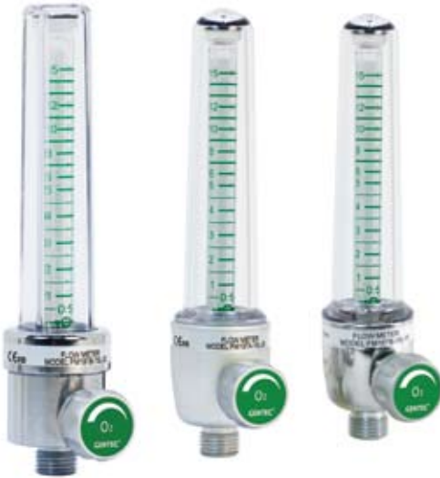
FM191-15L-XX Square Tube Chrome-plated Brass Body